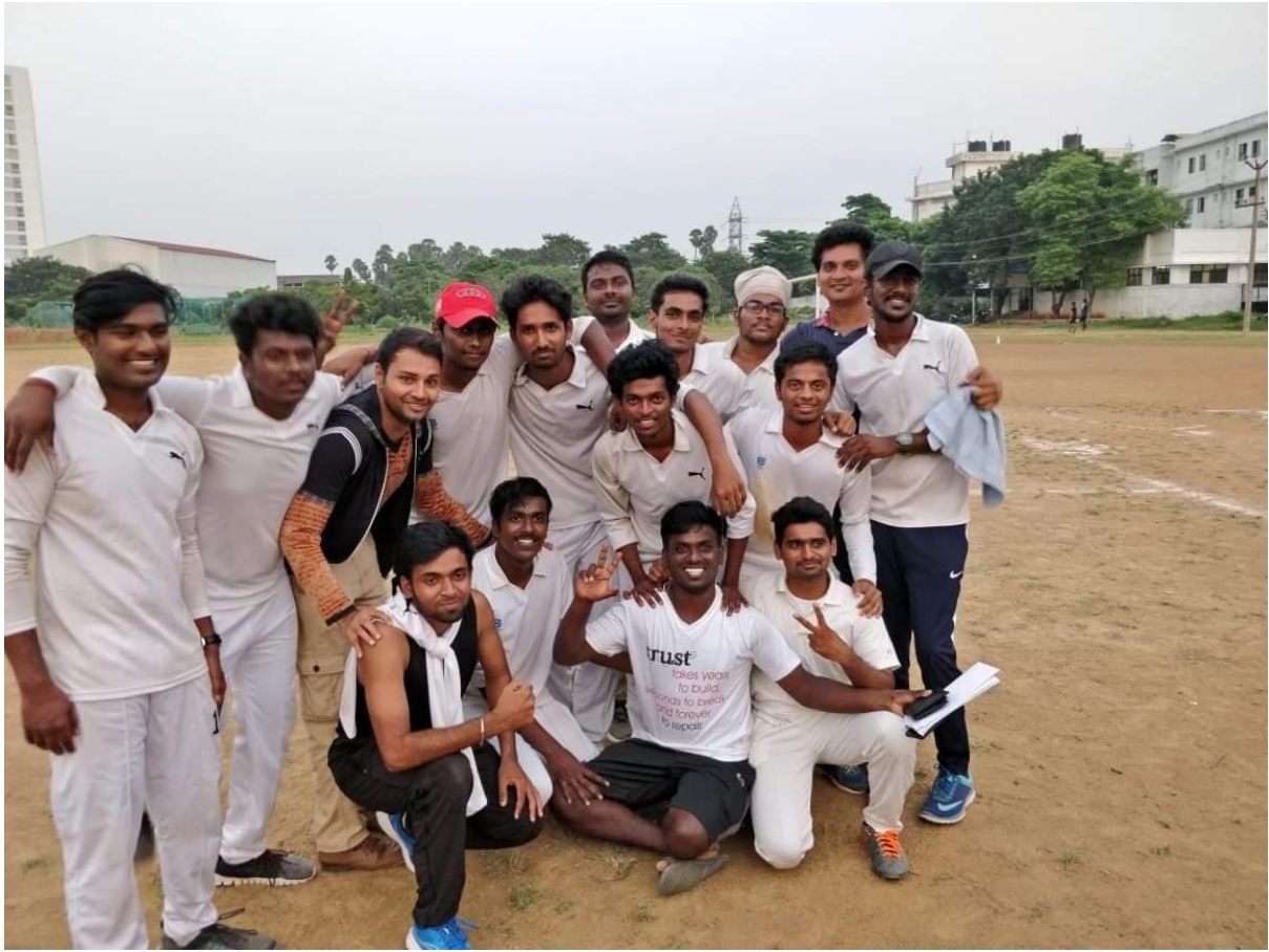
Intercollegiate meet SRM medical College 24 TO 27.OCT 2018