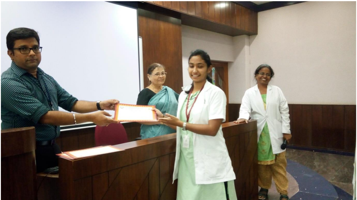
I MBBS Student receiving certificate from Biochemistry HOD